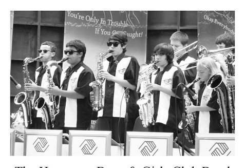
The Heatwave Boys & Girls Club Band sax section play saxophones donated by RAEF